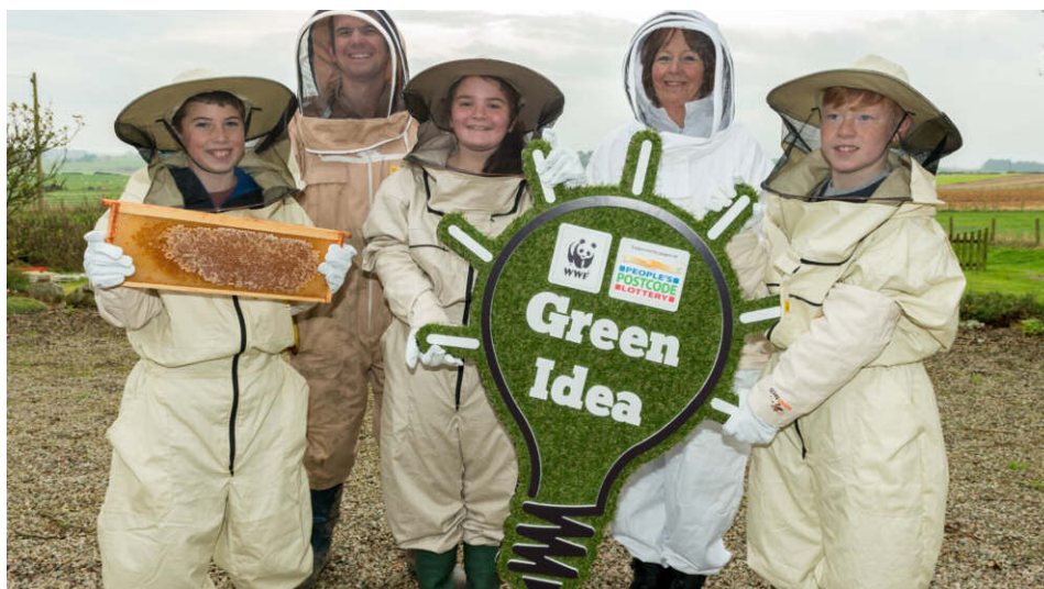
Greenbrae School win WWF National Prize

Can I ask that you use the school information line if you are checking as to whether or not the school is open. The number for this is: 0870 054 1999 Pin code: 011370 This number is also on the school website. If there are any changes to the schoolday a message will be put onto the information line by 8.15am.