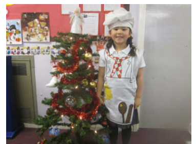
Greenbrae School pupils enjoy active learning experiences